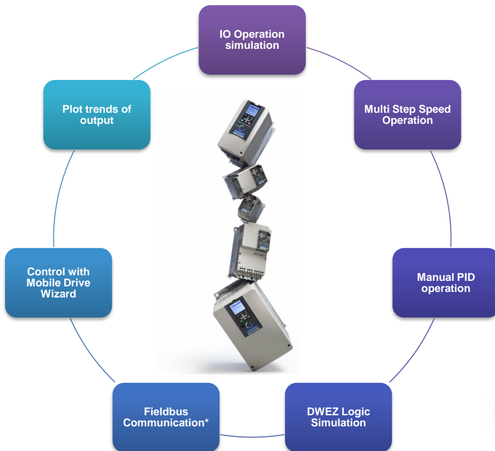
GA700 Training Kit