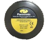
3 phase Induction Motor 50Hz.25W